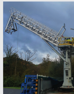
Produced in collaboration with Prosertek

Designed based on the latest technological innovations and practical applications, these gangways have anti-slip walkways, handrails and wide walkways.